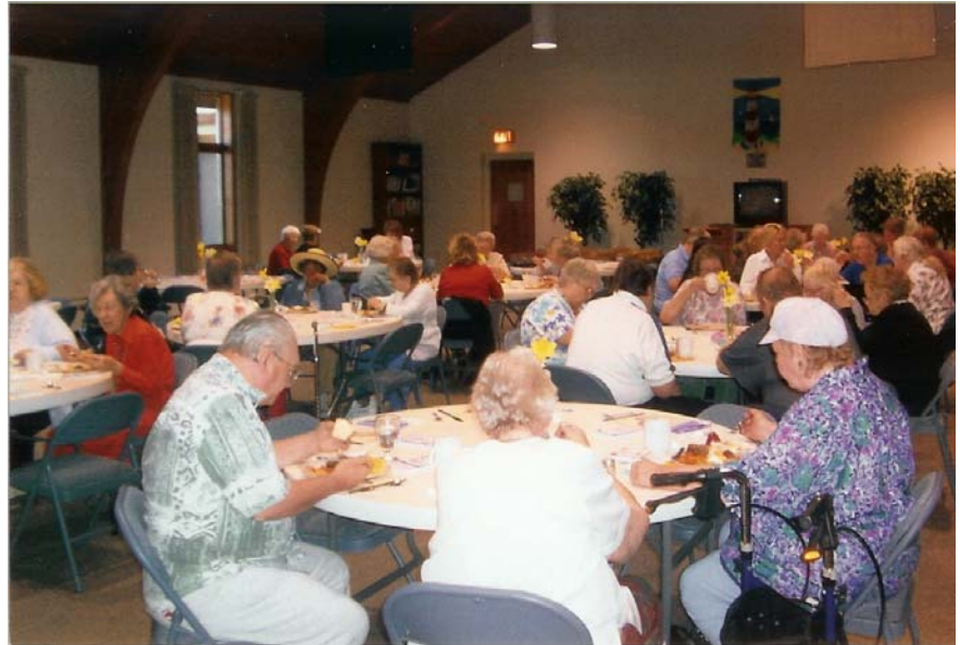
Photo taken at Senior World Luncheon held in April 2005

We urge everyone to try to arrive by 11:15 a.m. for the 11:30 a.m. lunch, and we aim to end around